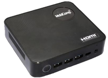
Plug & Play , user configurable.

"MINI FIREWALL" refers to a smaller, often more simplified version of a traditional firewall, Unlike the large, complex firewalls designed for protecting enterprise networks. mini firewalls are tailored for smaller scale environments or specific, focused applications. They can be either hardware-based, resembling a small network appliance, or software-based, designed to run on personal devices such as computers, tablet, server and smartphones.(minimum 5 to 50users)